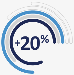
ROLLING RESISTANCE Higher is better